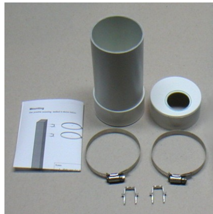
Illustration 3: Housing

http://unihedron.com/projects/sqmhousing/