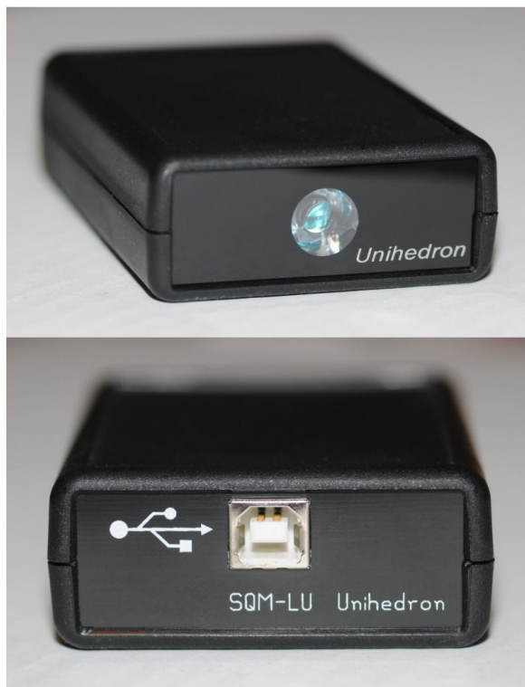
Illustration 2: Front and back of unit